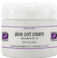
108 2 oz. (57g)

Ideal for post-procedure and post peel skin