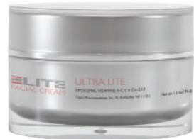
915 1.6 oz. (46g)