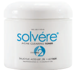
1929 60 pads