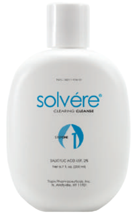
1926 6.7 fl. oz (200ml)