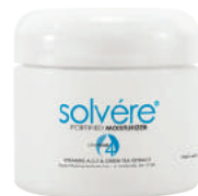
1915 2 oz. (57g)