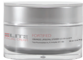
916 1.6 oz. (46g)