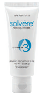
1410 1.5 oz. (42g)