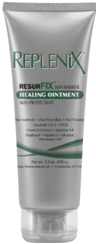
884 3.5 oz. (100g)