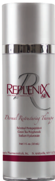
871 1 fl. oz. (30ml)