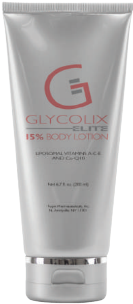
911 6.7 fl. oz. (200ml)