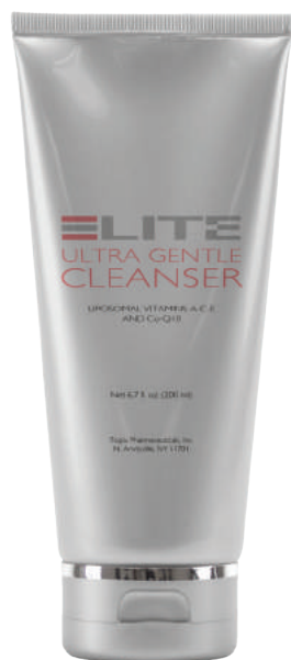
909 6.7 fl. oz. (200ml)

For all skin types, especially sensitive skin