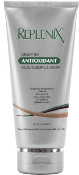
868 6 fl. oz. (180ml)