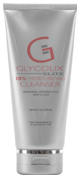
907 6.7 fl. oz. (200ml)