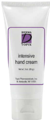
302 3 oz. (85g)