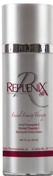
870 1 fl. oz. (30ml)